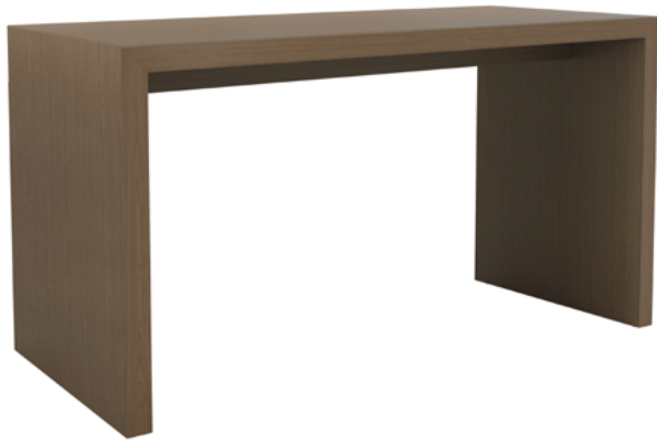
Model: LECOTBLB8436A 84W 36D 42H

The Lecco tables are completely constructed of easily cleaned and maintained Kwalu laminate material on steel reinforced frames. Lecco is available in multiple sizes and two heights, bar and counter height. An optional power grommet is centered on the tabletop and accommodates 2 power outlets and 2 USB ports. A magnetically attached panel is removable to access wires.